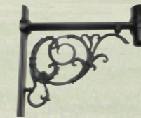
Austin Scroll AUS