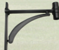
Austin Curved AUC